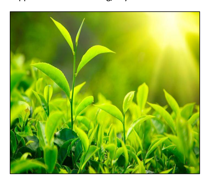
Fig.1 Leaves of Green Tea

patients exposed to stressful settings. Supplements: 200-400 mg/day