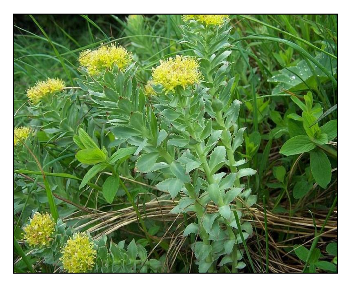
Fig4. Rhodiola Rosea

Rosenroot is a Ayurvedic medicine that may help to reduce high stress and lessen associated mind weariness. This natural herb help the body in dealing with stress more successfully. Several studies have demonstrated that supplements can boost mood and reduce feelings of suffer exhaustion in those who are nervous or extremely stressed. This medicine has been found to alleviate mental tiredness and boost feelings of well-being in persons during stressful periods of exams when taken in tiny daily doses. More research is required to discover appropriate dose and to better understand how the herb produces these benefits.