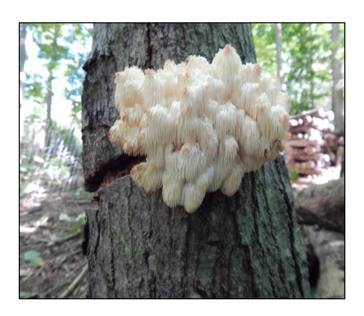
Fig.5.Lion's Mane Mushroom

Lion's mane mushroom as a tea to boost brain function. While there is no conclusive evidence relating lion's mane which is Alzheimer's disease prevention purposes, and have a neuro-protective effect in treating or preventing neurodegenerative illnesses, cell death, persistent inflammation and brain damage as a result of this.