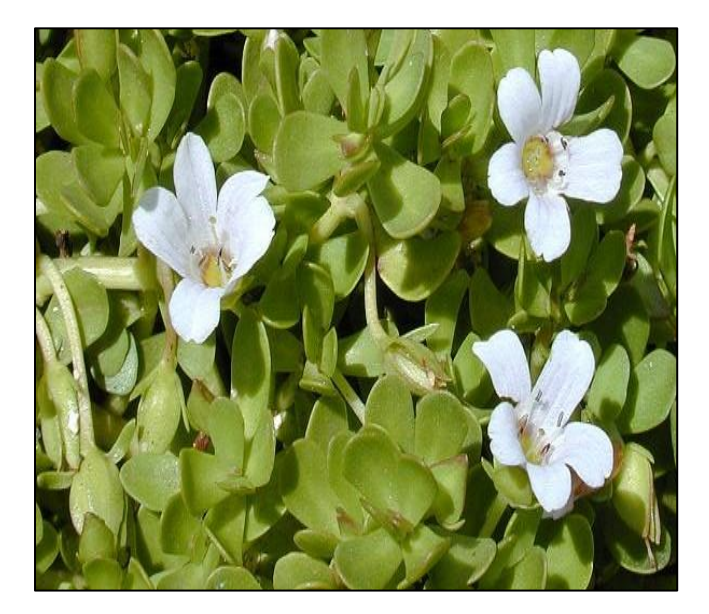
Fig 2. Bacopa Monnieri

Supplements: Doses of 300–600 mg should be taken for several months for maximum benefit.